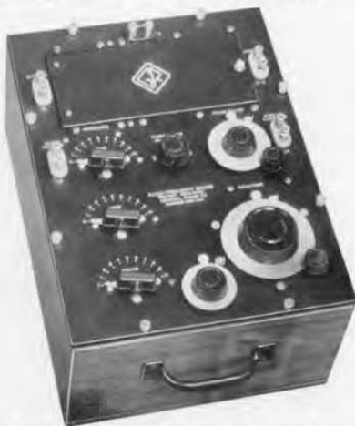
FIGURE 1. TYPE 516-C Radio-Frequency Bridge