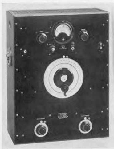
FIGURE 1. TYPE 713-A Beat-Frequency Oscillator

WHEN originally announced in the July, 1935, issue of the Experimenter the TYPE 713-A Beat-Frequency Oscillator was calibrated between 10 and 16,000 cycles per second. The actual frequency range covered is greater than this, and, in order to take full advantage of the capabilities of the instrument, the upper limit of calibration has been extended to 20,000 cycles. Units currently available are calibrated over this larger range.