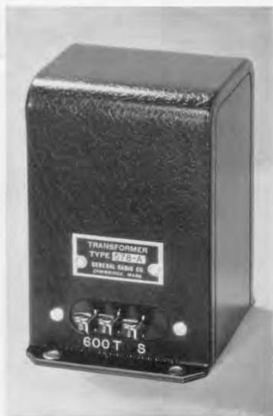
FIGURE 3. TYPE 578 Transformers are available on plug-in bases for use with the radio-frequency bridge. The model shown in the photograph can be used between the bridge and the a-c line for 60-cycle measurements

natural frequency varies as the square root of the total capacitance, it ceases to be an important limitation in capacitance below 100 kc. For the same reason, resistors need no longer be compensated for inductance below that frequency; but the capacitance to ground of the rotor of the standard condenser and of the three decade resistors, amounting to about 100 μmf, will be placed across this added resistance. This shunt capacitance sets limits of perhaps 1000 ohms at 100 kc and 100,000 ohms at 1 kc.