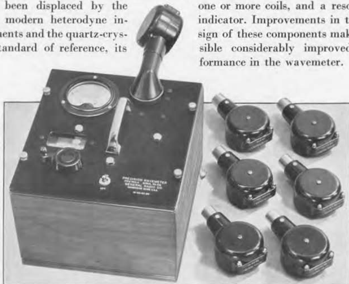
FIGURE 1. TYPE 724-A Precision Wavemeter

The absorption-type wavemeter consists fundamentally of a condenser, one or more coils, and a resonance indicator. Improvements in the design of these components make possible considerably improved performance in the wavemeter.