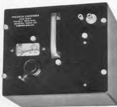
FIGURE 1. External view of a TYPE 722 Precision Condenser

condenser is in the vicinity of 1100 μf, which provides a direct-reading range of 1000 μf.